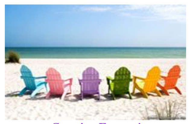
Creative Escape! April 25, 26 & 27, 2023

Who is Ready for a CREATIVE ESCAPE? We are planning for one on April 25, 26 & 27, 2024! That must mean that it is time to start preparing for our Spring Painting Retreat!