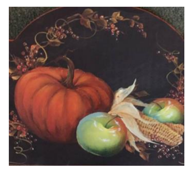
Saturday, July 29th