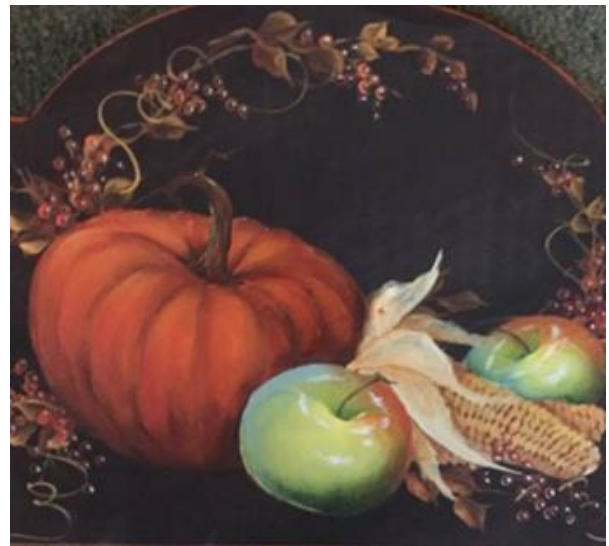
Saturday, July 29th