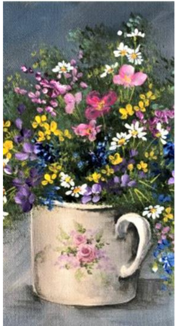
Friday, July 28th