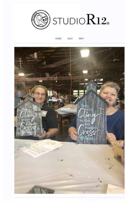
Our friends in the Illinois Heartland Decorative Artists met recently for their Spring Retreat, had a great time and painted some beautiful art!