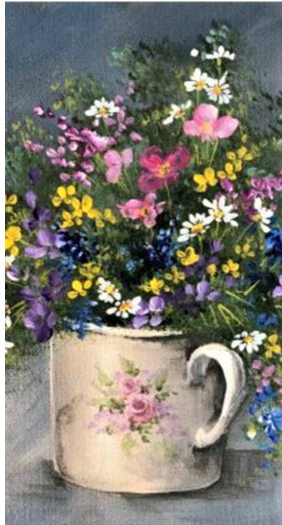
Friday, July 28th