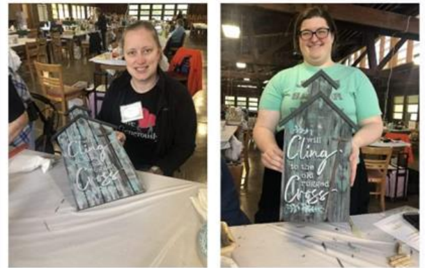
These ladies did an incredible job on our Old Rugged Cross project! We are so happy they shared with us!!

WOW! Our 2023 Spring Retreat received National exposure in June! One of our vendors, StudioR12, who graciously donated items for Lucky Bucks & our Goody Bags featured our 'Old Rugged Cross' class project pictures in a daily email! IHDA also received a shout out on their YouTube Channel Live later that week!