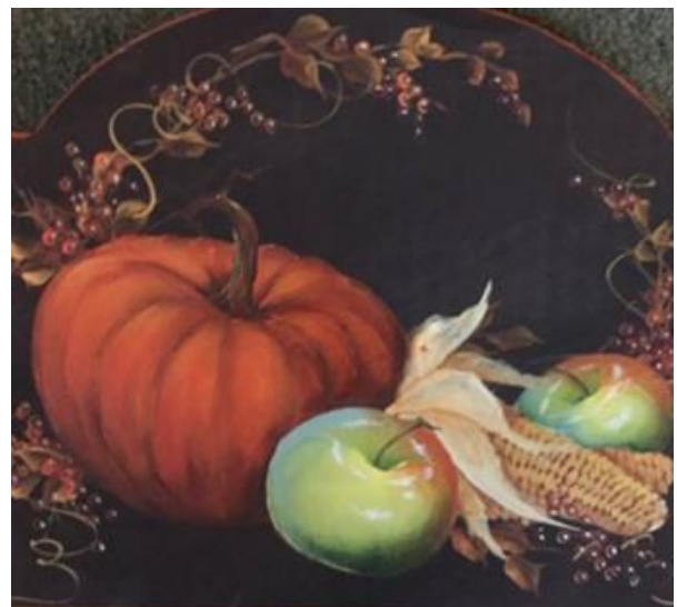
Saturday, July 29th