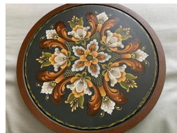
Ruth Green – September 10th