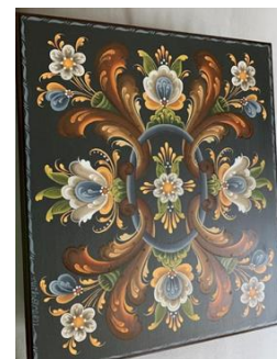
Ruth Green – September 11 th