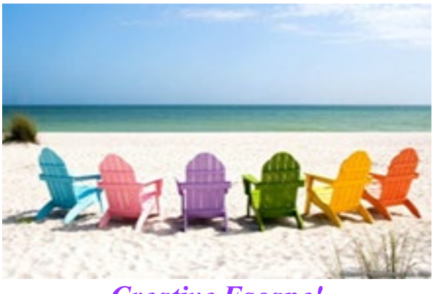
Creative Escape! April 25, 26 & 27, 2023

Items should be priced if being brought to the show. If you need help with pricing, please reach out. Folks near Champaign are welcome to contact Jo Menacher to drop off at her house.