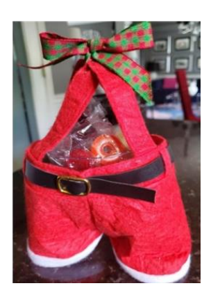
We have 14 of these cute "Santa Britches" to also fill with Candy for the sale...

In October we will fill these with candy to be sold at the November Craft Sale. But wait...there's more!