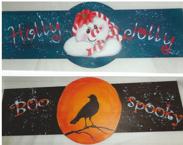
15 "Holly Jolly & Boo Spooky" Teacher: Mary Sterling

Email: Kiddo4321@sbcglobal.net Phone: 630-325-3853 Medium: Acrylic Skill Level: All Size: 14" w/ 5" Circle Surface: Your Choice