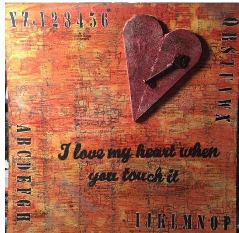
16. "Heart Touch" Teacher: Cynthia Estes

Email: cindi3021@yahoo.com Phone: 317-289-1020 Medium: Acrylic/Mixed Media Skill Level: All Surface Size: 12" x 12" Source: Cynthia Pre-Pay: No Kit Cost: $25 (Stamp set, white pen, stencil, applicator, heart form, key, tissue wrap, surface)